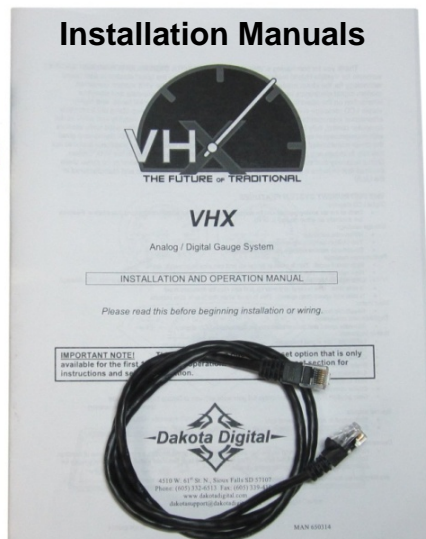
(1) 36" CAT5 Cable