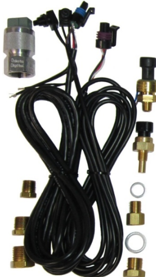
Universal Sender Pack