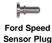
Ford Speed Sensor Plug