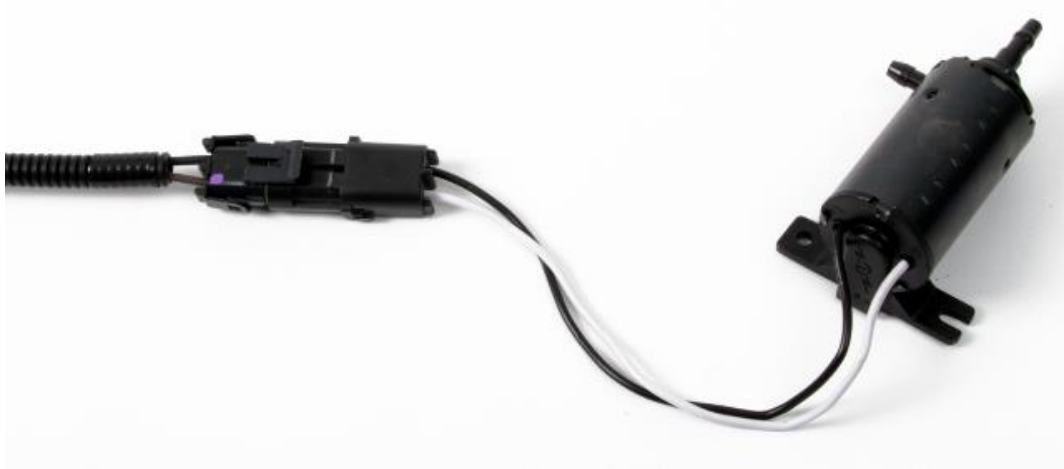
Figure 3 – Connect the Weather pack connectors