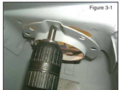
Figure 3-1 applies only to vehicles using carriage bolts to secure the factory upper shock mount.

Note: Fairlane shock towers use a slightly different bolt pattern and must be drilled to match the adapter and backup plates. Structural integrity is maintained through use of the backup plate.