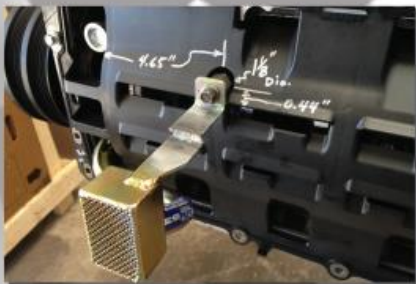
Image left shows the location you will need to modify the tray in order to properly mount the pickup tube. In addition to this modification you will also need to move the pickup mounting bolt from the OE position to this location.

Due to the lack of OEM front sump Coyote applications there are a few modifications needed to properly install our front sump coyote pan.