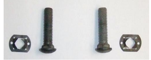
PEDAL HANGER TO CAR BOLT & CLIP (QTY 2)