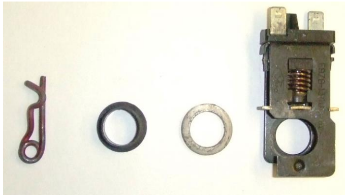
COTTER PIN, BUSHING, WASHER, & BRAKE LIGHT SWITCH