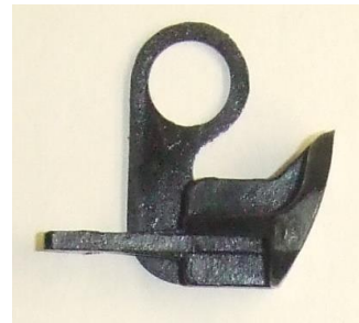
CRUISE CONTROL CANCELLATION BACKSTOP CLIP