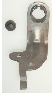
CRUISE CONTROL BRAKE DUMP VALVE BRACKET & SCREW (NOT EQUIPPED IN ALL CARS)