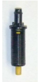
CRUISE CONTROL BRAKE DUMP VALVE (NOT IN ALL CARS)