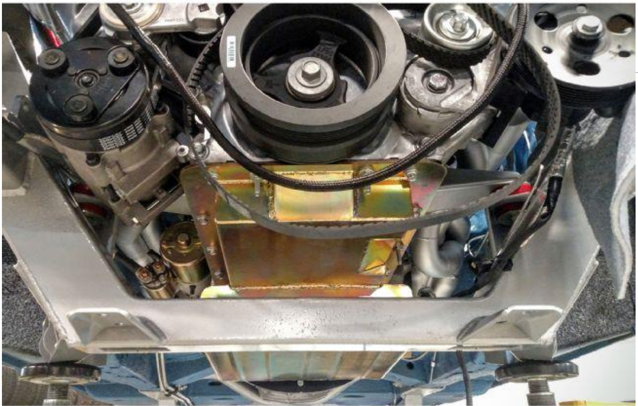
11. This bottom shot shows the oil pan and accessories clearance.