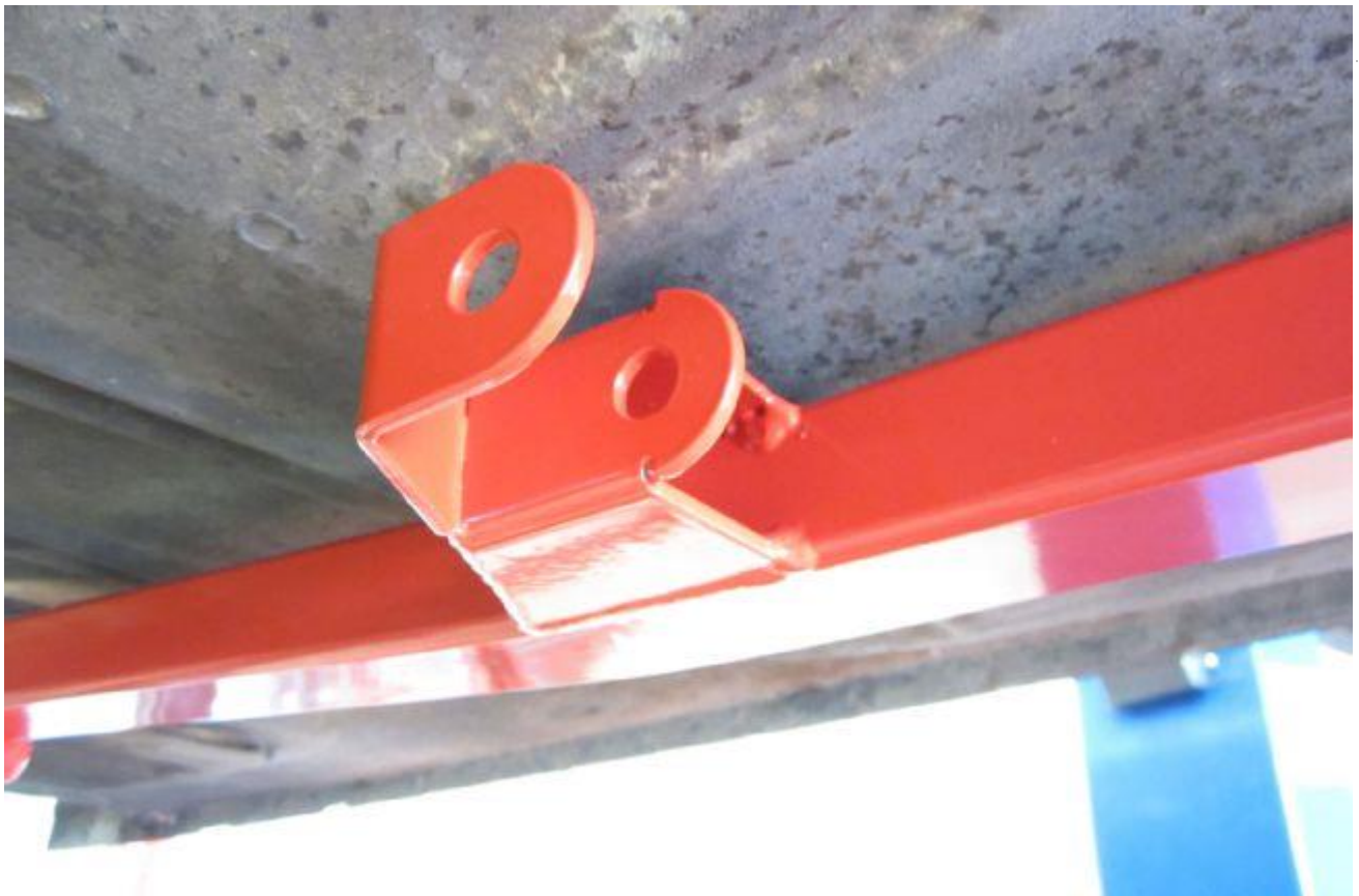
16. Here's a close-up of the front strut rod mount for the IRS.