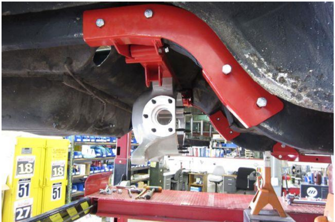
17. This is the passenger-side frame saddles, top crossmember, and IRS bare center section mounted during mockup. The center section (differential, ring-and-pinion, axles, and such) comes disassembled and must be put together by the end user.