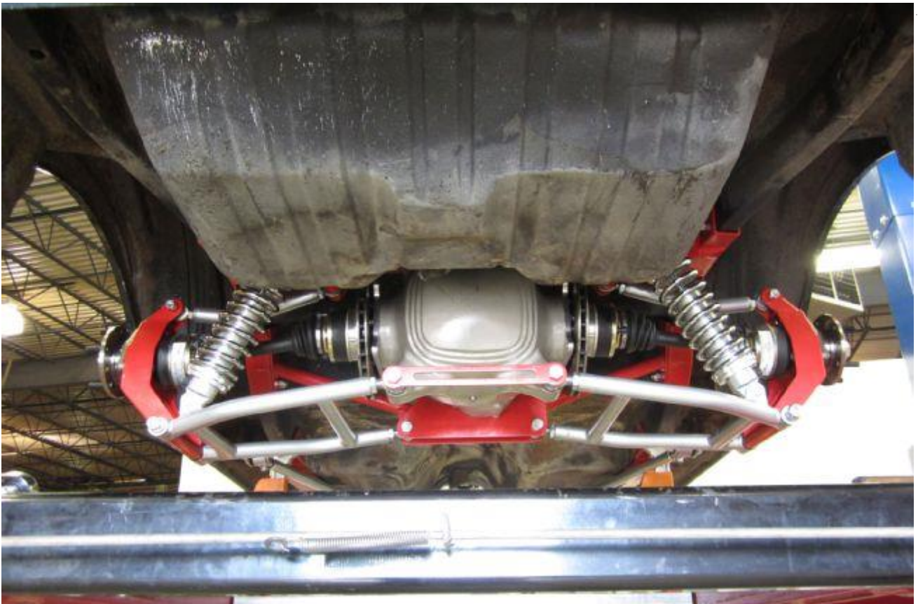
22. Here, the completed Heidts IRS is installed and ready for action. Now, it will be removed for underside detailing on the entire car.