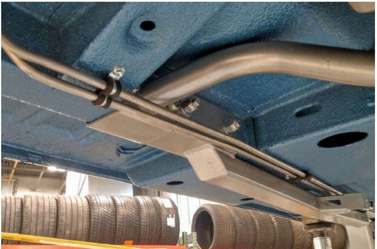
13. Blackdog Speed Shop also bent these pretty stainless fuel lines and all the brake lines on the car.