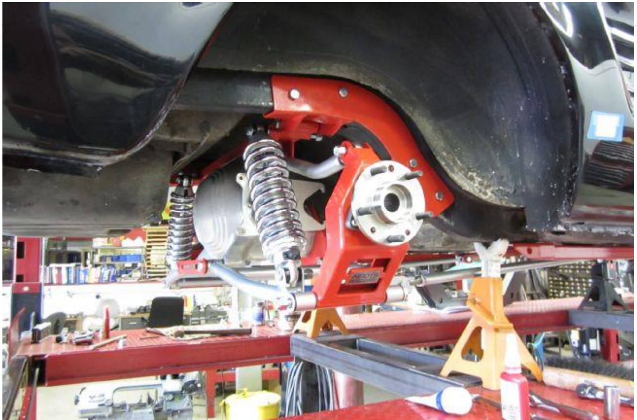
20. With coilover shocks installed, it's getting close to the end.