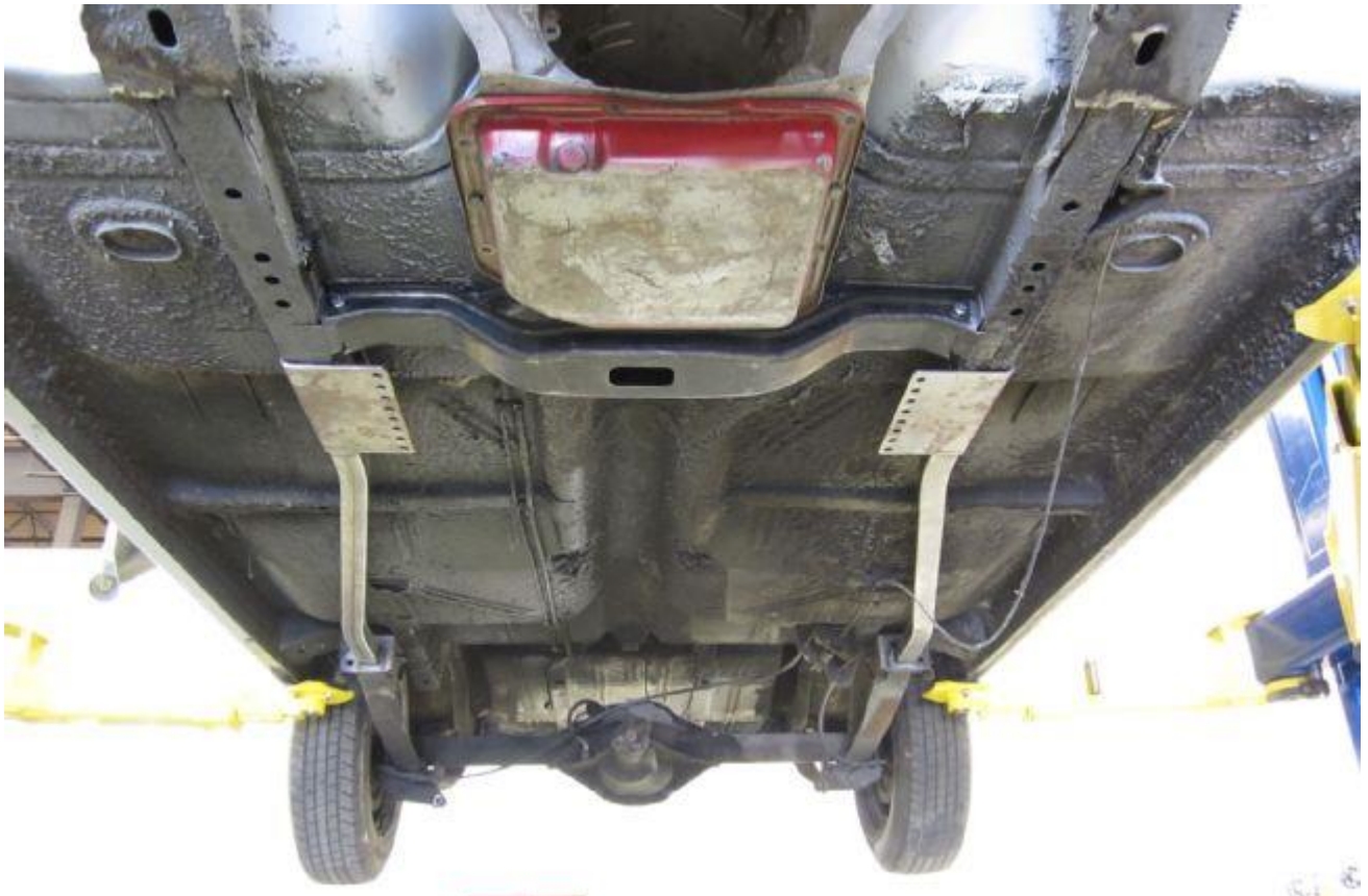
14. When Leyshon bought the car, it had these generic subframe connectors. This is during initial installation of the Heids. As you can see, the entire rear suspension must be removed. And it makes life easier during the installation if you remove the gas tank, temporarily, too. Now would also be a good time to clean, paint, and undercoat the backside of the car.