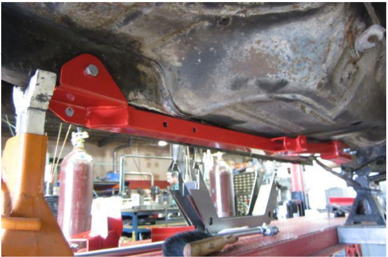
15. These Heidts subframe connectors also serve as a front mount for the suspension strut rods.