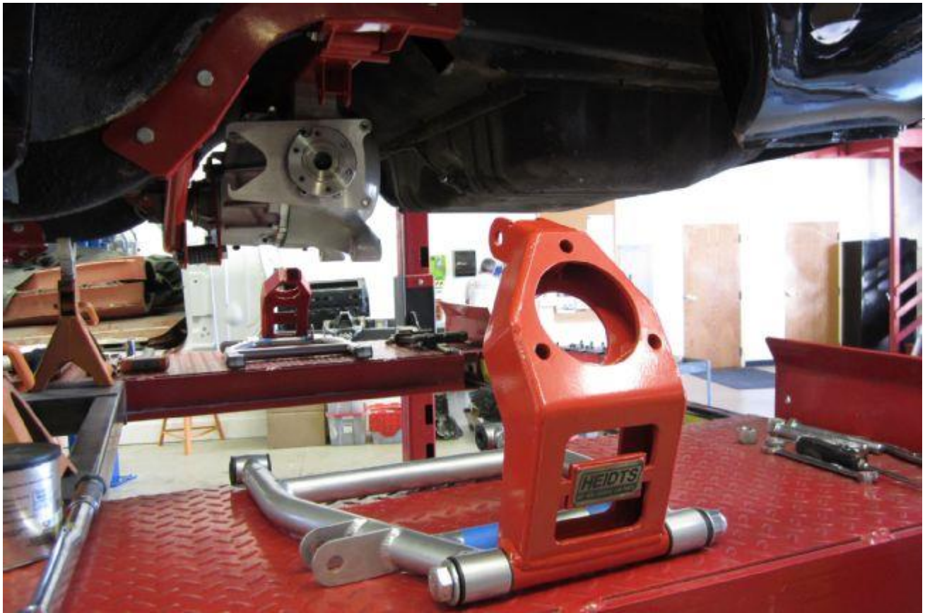
18. The axle hubs are connected to the lower control arms to prepare for installation into the center section. The center section has been assembled with caliper brackets and axle stubs installed.