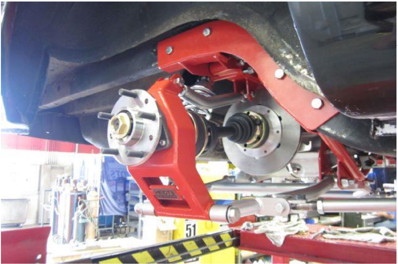
21. Here's the IRS configuration with the half-shafts and CV joints fully installed.