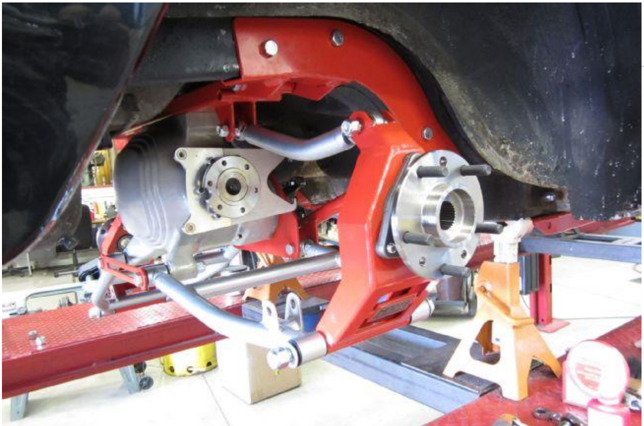
19. The upper control arms are installed